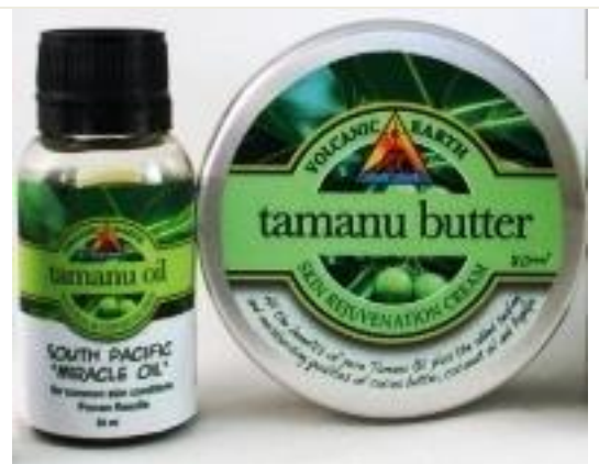
100% Pure Tamanu Oil

Source: Dweck, A.C.: Calophyllum inophyllum – Tamanu oil the African, Asian, Polynesian and Pacific Panacea. International Journal of Cosmetic Science 24 , 6, 1-8 (2002).